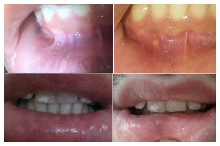
Figure 2. Patients in Popolis group before (right) and after (left) treatment.

Table 1. The severity of pain and aphthouse of aphtous lesions before treatment, second & sixth day of treatment with Propolis & Persica mouthwashes.